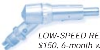
LOW-SPEED REPAIR $150, 6-month warranty